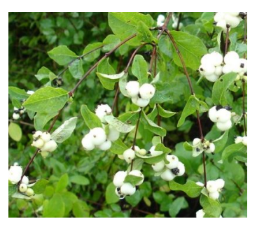
Symphorycarpos racemosa (Snowberry)

STOMACH – VOMITING – pregnancy, during 74 STOMACH – VOMITING – blood – pregnancy, during 1 STOMACH – VOMITING – milky – pregnancy, during 1 STOMACH – VOMITING – mucus – pregnancy, in 1 STOMACH – VOMITING – water – pregnancy, during 1